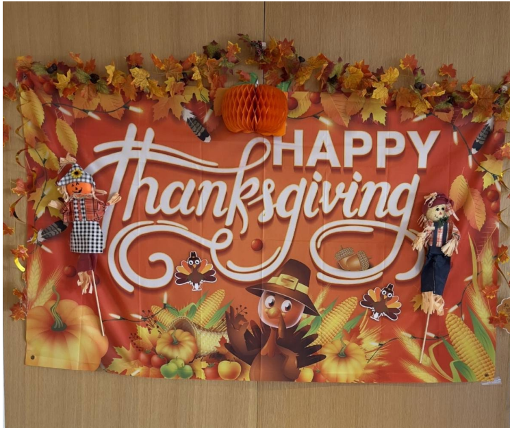
Scenes from the SeaTac Kidney Center Thanksgiving celebration