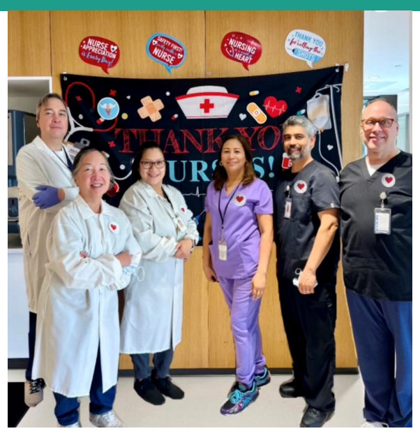
Rainier Beach clinic celebrated Nurses Week last week